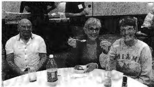
VQ Association October 2021 Reunion Providence RI